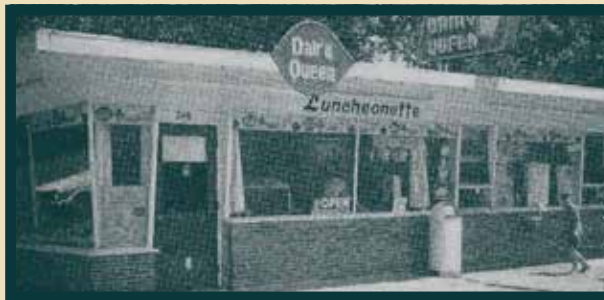
Mamma Mia! Pizzeria is located in the old Dairy Queen building

*Consuming raw or undercooked meats, poultry, seafood, shellfish, or eggs may increase your risk of food-borne illness, especially if you have certain medical conditions.